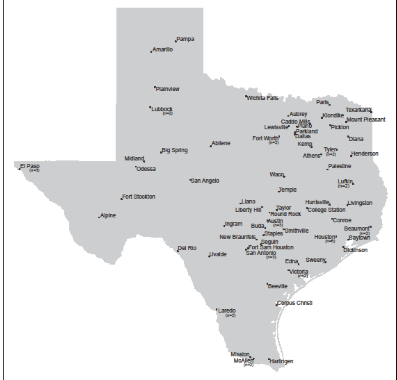
Figure 1. SANE coordinators in Texas Pampa .Amarillo