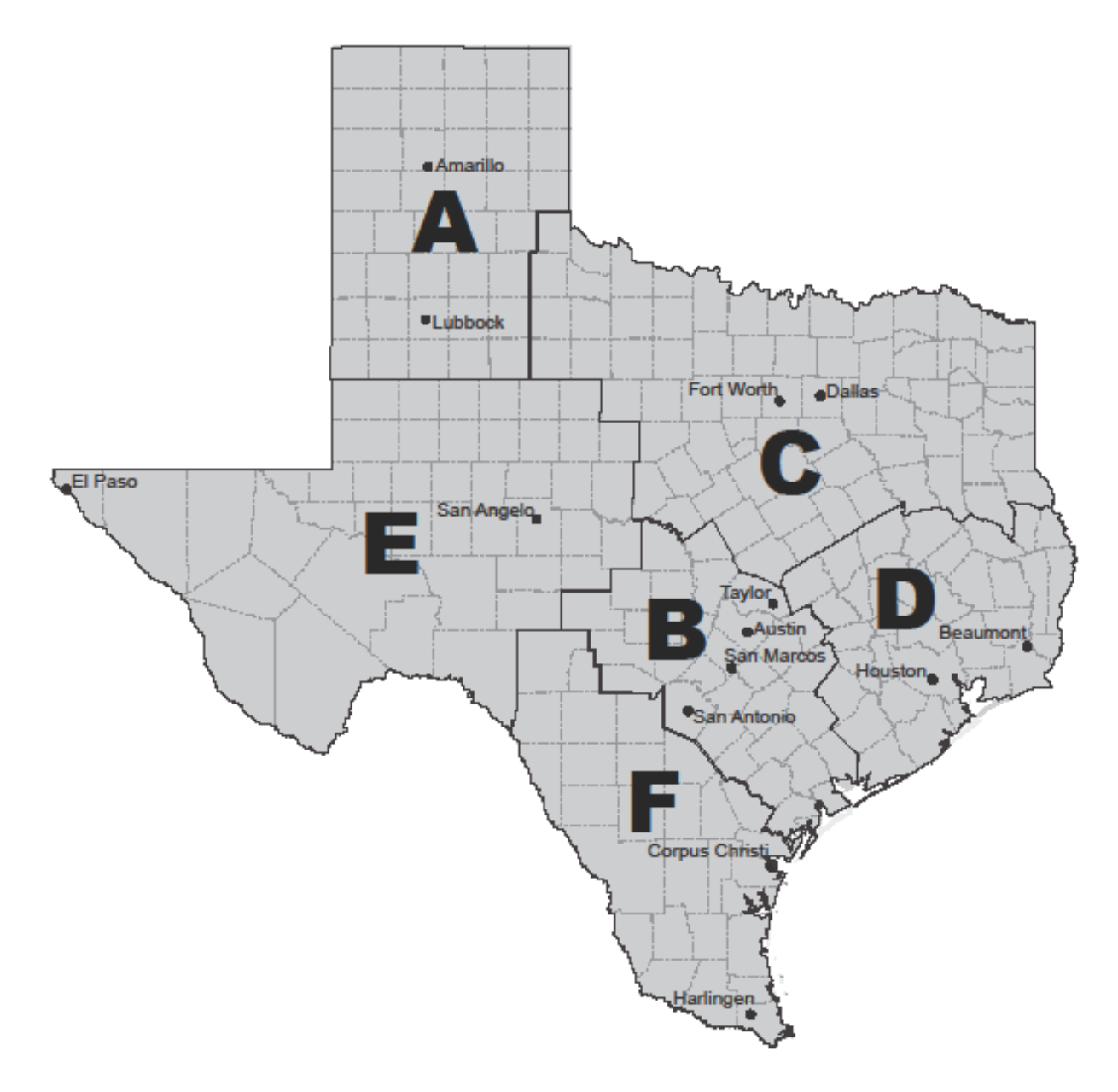
Figure 2. Interview field sites